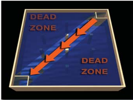
SHORT CIRCUIT WITHOUT BAFFLES