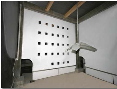
ENHANCE FLOW PATTERNS