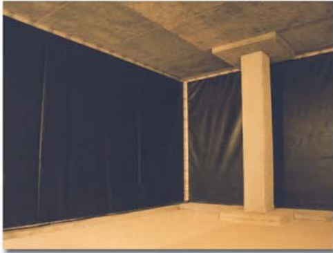
STRUCTURAL FRAME DESIGN