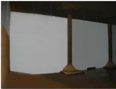
CABLE SUPPORTED DESIGN